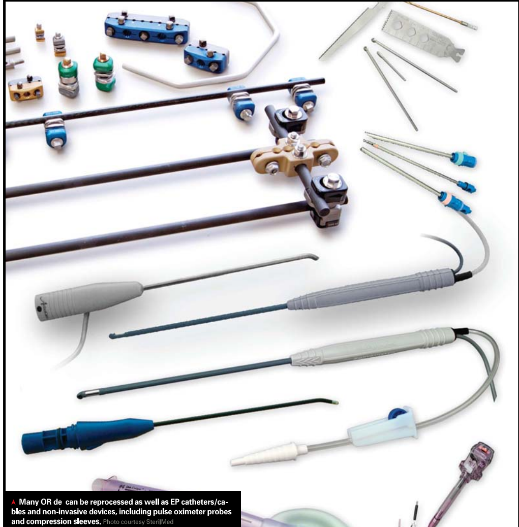
▲ Many OR de can be reprocessed as well as EP catheters/cables and non-invasive devices, including pulse oximeter probes and compression sleeves.